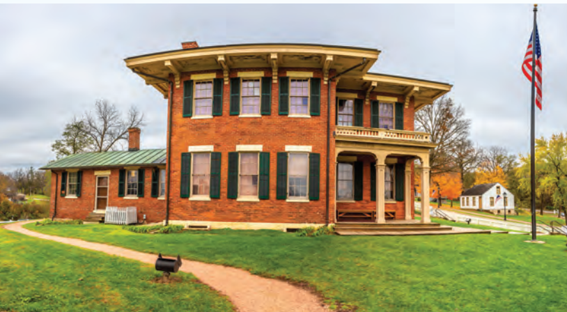
(Galena, IL) Ulysses S. Grant's home. Listed on the National Register of Historic Places as well as a National Historic Landmark.