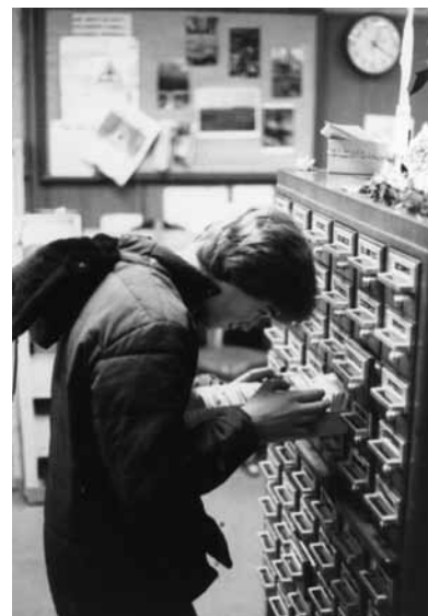
The old card catalog.