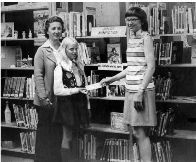
The Library in the basement of St. Francis de Sales Church.

Steady growth and support in our community allowed for the constant transformation of our Library over the last 40 years. As a community-wide investment, your Library continues to show great returns year after year. So many of you have grown with the Library and the Library has grown with you. We look forward to continuing to grow – together.