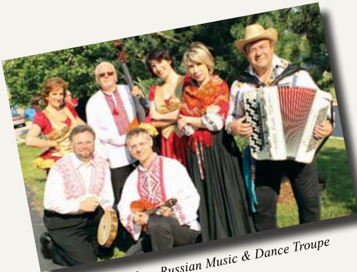
Chicago Cossacks – Russian Music & Dance Troupe

Spend the month with us as we explore dance and culture from around the globe. Families welcome. Registration not required (NR), unless noted.