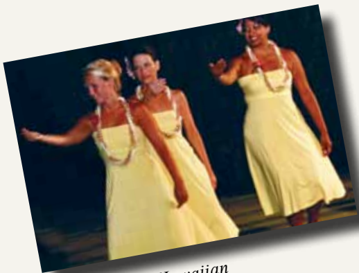
The Barefoot Hawaiian

Win an eReader and other fabulous prizes by attending Multicultural March events. Pick up a postcard at any of the programs and receive a stamp for each event you attend. Drop your postcard in our raffle mailbox between March 31-April 15. Lucky winners will be announced April 16. One entry per family.